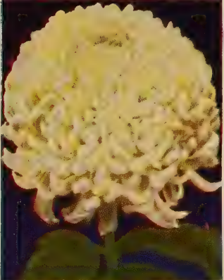
AMBASSADOR 50c each; 3 for $1.25